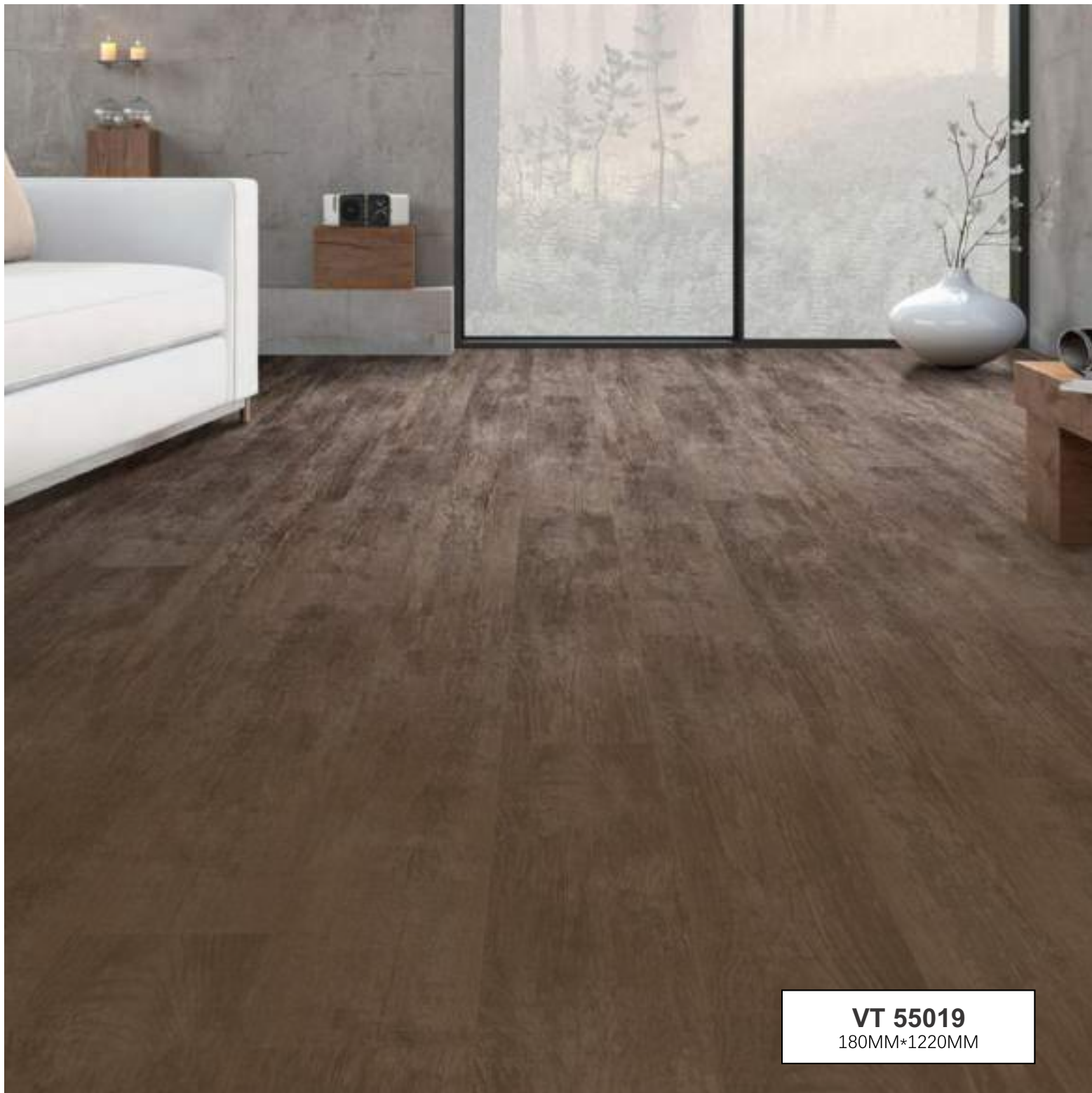
VT 55019 180MM*1220MM